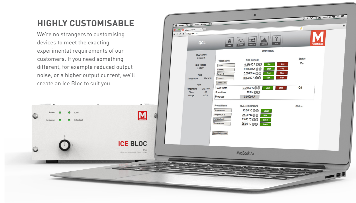
Pictured: Ice Bloc user interface (content varies between models)

We're no strangers to customising devices to meet the exacting experimental requirements of our customers. If you need something different, for example reduced output noise, or a higher output current, we'll create an Ice Bloc to suit you.